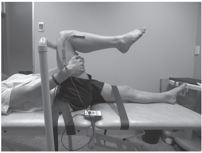
Figure 2: Start position of the active knee extension (AKE) test.

Prior to data collection, a pilot study assessing the intra-rater reliability of the AKE test was undertaken. Ten participants (mean age, 24.8 (SD 4.3) years; height, 172.9 (SD 6.1) cm; weight, 68.0 (SD 16.7) kg) from a sample of convenience took part in the reliability study. Using the data-collection procedures outlined earlier, two sets of measurements of active knee extension were completed on two separate occasions with 10 minutes intervals (Depino et al 2000, Spernoga et al 2001). The intra-class correlation coefficient (ICC, 2,1) for the paired data was 0.99, establishing excellent test-retest reliability (Bandy and Irion 1994, Bandy et al 1998, Ford et al 2005).